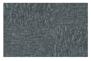
0088 GENTLEMAN GREY